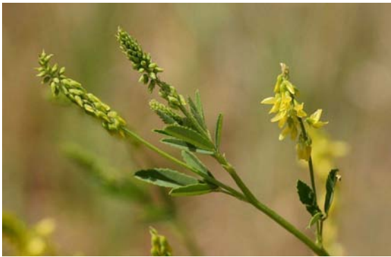
Sweetclover flower