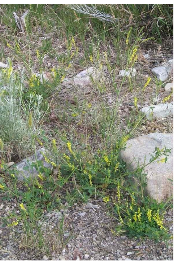
Yellow sweetclover.

Plant Symbol = MEOF, MEAL2 Contributed by: Idaho NRCS State Office and Aberdeen, ID Plant Materials Center